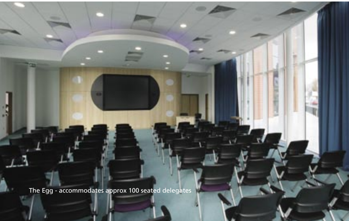
The Egg - accommodates approx 100 seated delegates